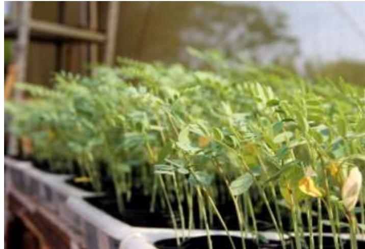
Figure 1. Seedlings of Sesbania virgata under irrigation with composted sewage sludge solution.

The maximum, average and minimum temperature, average global solar radiation and relative humidity of the air were collected, Figure 2 shows the values. The meteorological data were used to determine the reference evapotranspiration ( ETo ) according to the Penman-Monteith model (ALLEN et al., 1998).